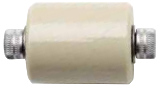
111176 / Ceramic Standoff